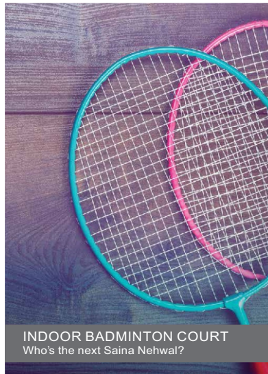
INDOOR BADMINTON COURT Who's the next Saina Nehwal?